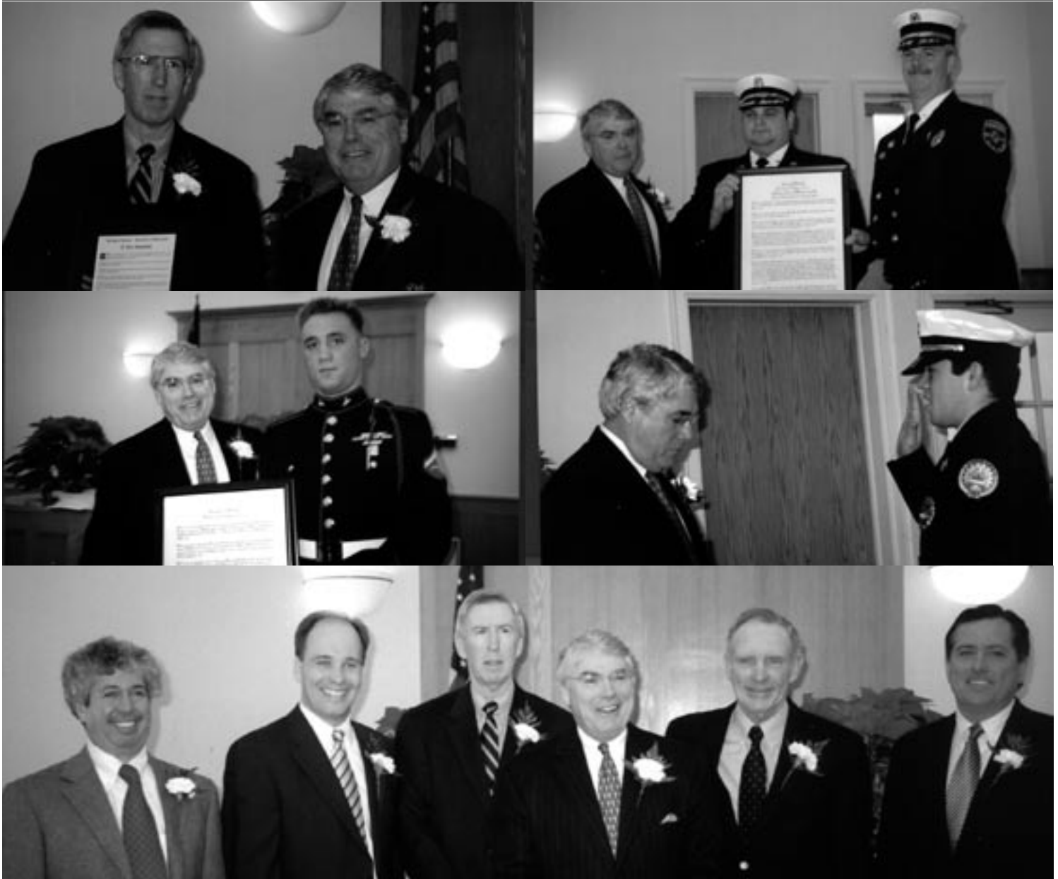
Borough of Rumson Reorganization Meeting on New Years Day, 2005