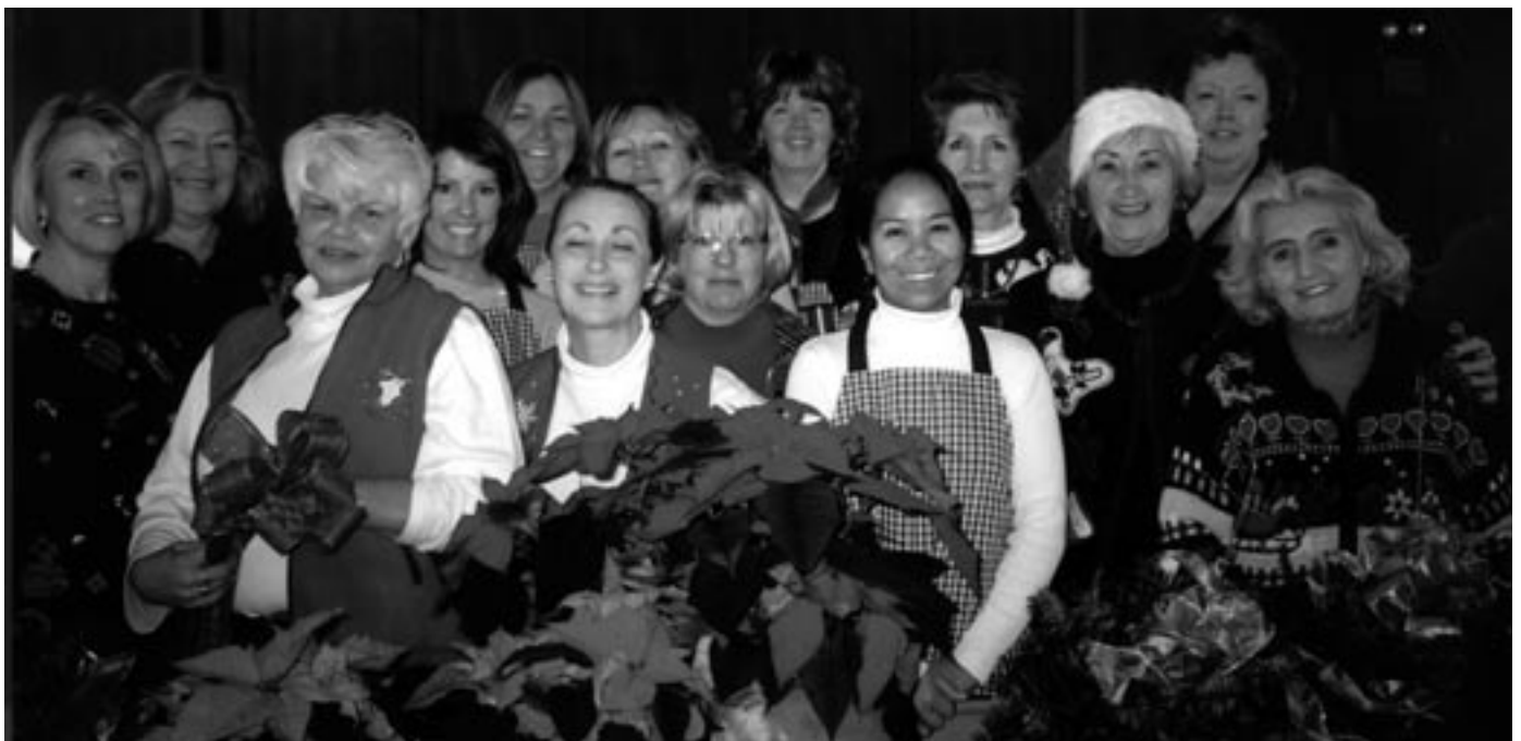
Thr Rumson Women's Club Annual Holiday Bazaar, December 4, 2004.

This is a special time each year as Pack 11 Webeles "graduate" from Cub Scouts to Boy Scouts. Troop 201 welcomes these new Scouts and invites any boy who has finished 5 th grade or is 11 years old, into a program that is not only fun and adventurous, but also instills the values of leadership, teamwork, and the Scout Oath and Law. Meetings are held every Wednesday night at the Forrestdale School cafeteria from 7:30 -9:00 p.m. No experience necessary!