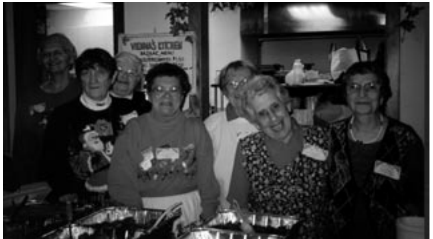
Members enjoyed the Christmas Bazaar on November 20, 2004.