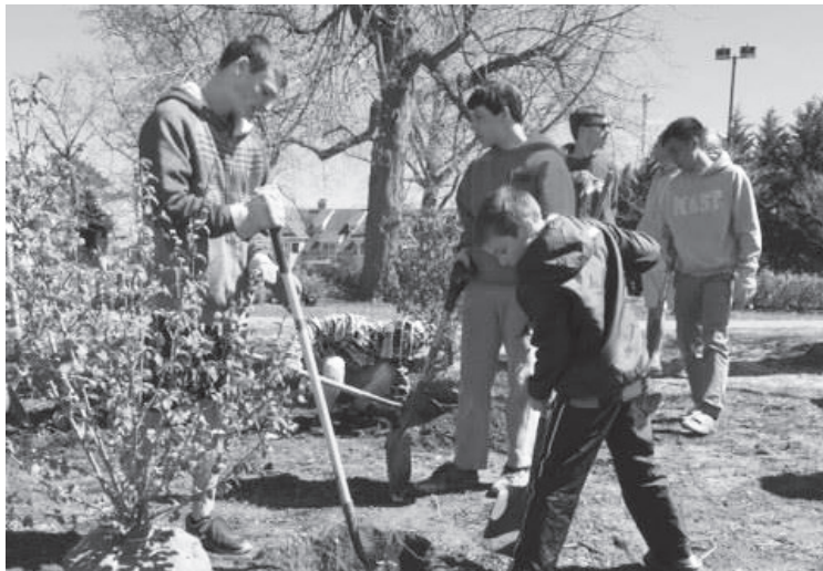
Boy Scout Troop 201 planting trees at Victory Park

In 2015, the STC and RGC teamed up with Borough staff to design, fund and implement the extensive renovation of Victory Park's west border, including the new Borough Christmas Tree. DPW oversaw the removal of 25 large trees and the Garden Club