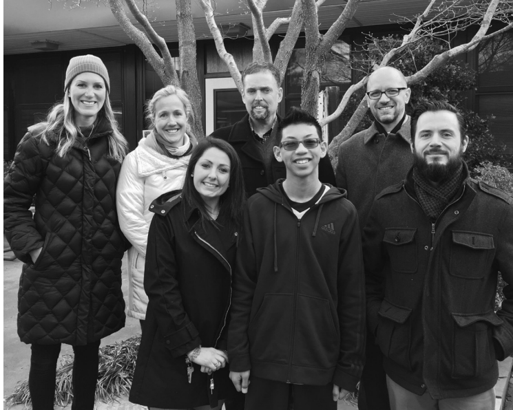
2016 Rumson Schools Arbor Day Organizers

The fundraiser was a terrific success and the students exceeded their goal of $3600. The result will be a campus rich in trees and outdoor educational opportunities.